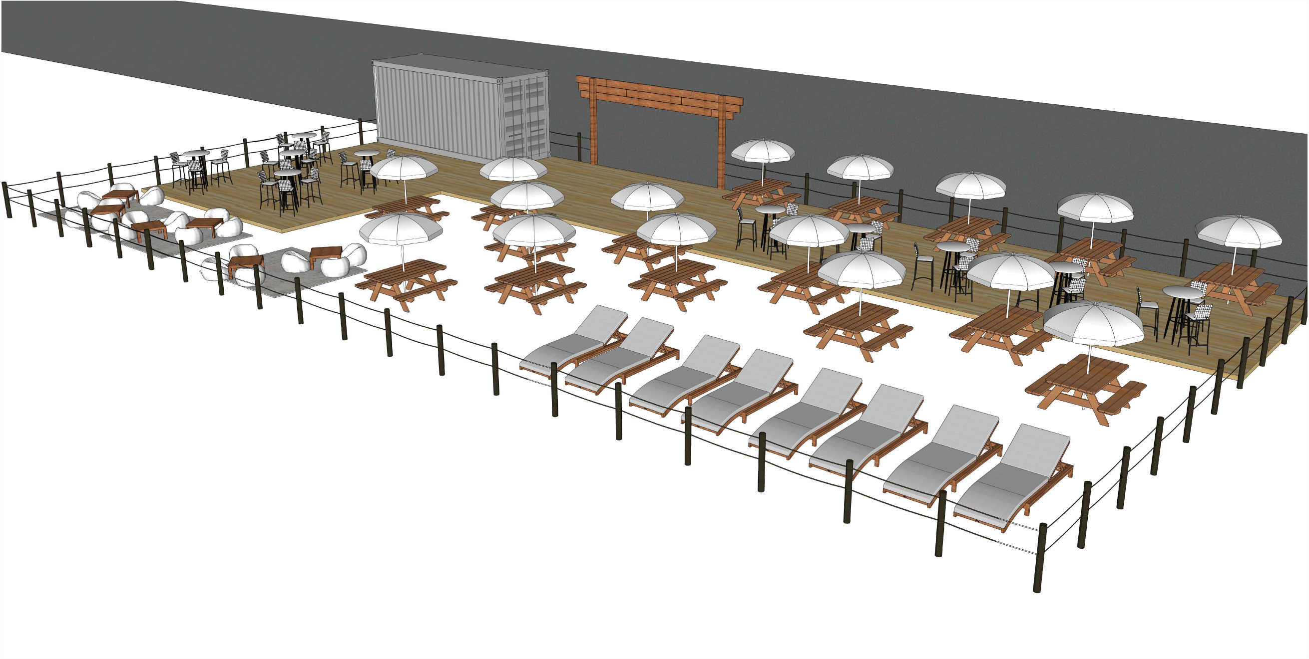
Proposed 3D Model Perspective 3