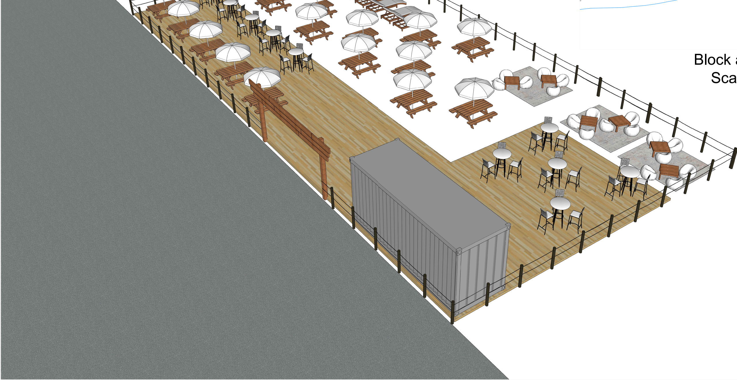
Proposed 3D Model Perspective 2